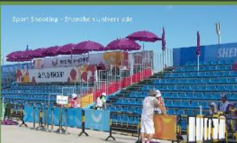
Sport Shooting - Shenzhen Universiade