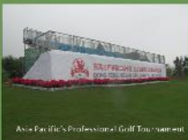
Asia Pacific Professional Golf Tournament