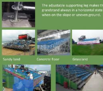
Sandy land Concrete floor Grassland