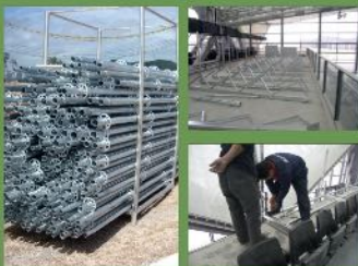
Professional installation and Maintenance team On-site modular assembly All-weather work.