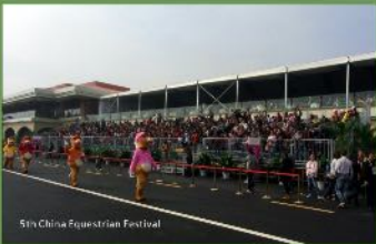
5th China Equestrian Festival