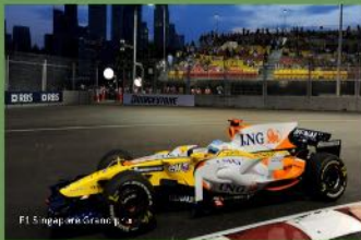
F1 Singapore Grand Prix