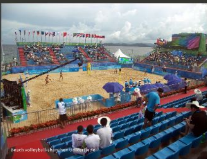
Beach volleyball - Shenzhen Universiade