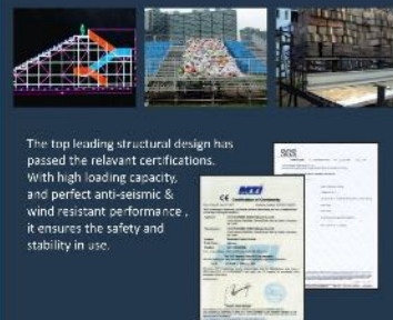
The top leading structural design has passed the relevant certifications. With high loading capacity, and perfect anti-seismic & wind resistant performance, it ensures the safety and stability in use.

Aneas Demountable Bleacher Seating System consists of Main Supporting System, Seating System, Aisle System and Safeguard System. It is widely applicable in sporting events, theatrical performance, meeting and other activities for temporary use.