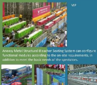
Aneas Metal Structural Bleacher Seating System can configure functional modules according to the on-site requirements, in addition to meet the basic needs of the spectators.