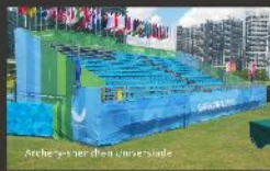
Archery - Shenzhen Universiade