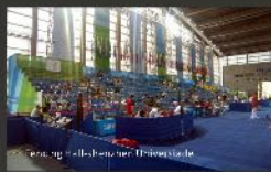
Beach volleyball - Shenzhen Universiade