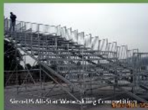
Grand Prix All-Star Wrestling Competition