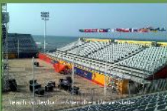
Beach Volleyball - Shenzhen Universiade