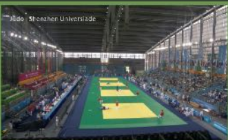
Judo - Shenzhen Universiade